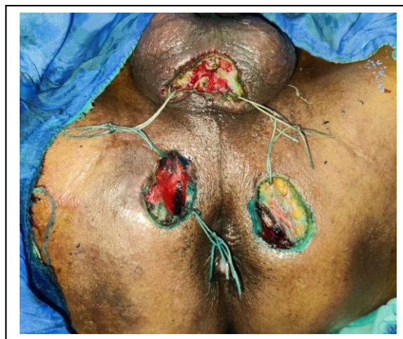
At the time operation