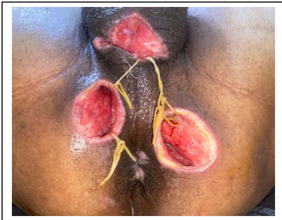
8 th week