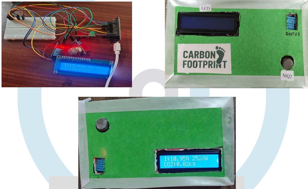
Fig. 2: Hardware Implementation of the Proposed System

From an industrial perspective, the results highlight the potential of the system for energy auditing, carbon tracking, and sustainability management. Although the prototype uses low-cost sensors, the architecture can be scaled using industrial-grade components to achieve higher accuracy and reliability.