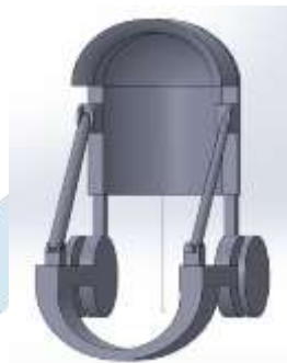
Fig 5 : Solid Work Design (Hand)

The Proposed system process begins with identifying the specific needs of the target users, which include industrial workers who require support for lifting and carrying heavy loads activities. The versatile upper limb exoskeleton is designed to support both bulk and medium weight individuals, ensuring versatility and broad applicability. To accommodate various body sizes, the exoskeleton features an adjustable mechanism that allows for a universal fit. This ensures that the device can be used by a wide range of individuals without compromising on comfort or functionality.