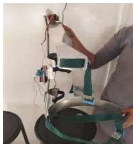
Figure 6 : Proposed Model Image