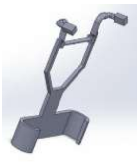
Fig 4 : Solid Work Design of (Bach Support)