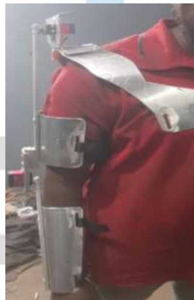
Figure 3 : Wearing exoskeleton Model