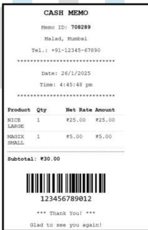
Fig 4.2 Cash Receipt

The website dashboard, as illustrated in Fig 4.1, serves as a user interface for the checkout system, it includes the option of uploading the image where the cashier uploads the images with all the products in the image. The uploaded image is then processed and all the objects inside the image are detected. After detecting all the products, the system fetches the prices of the products from the database and displays the price of the product in the list.