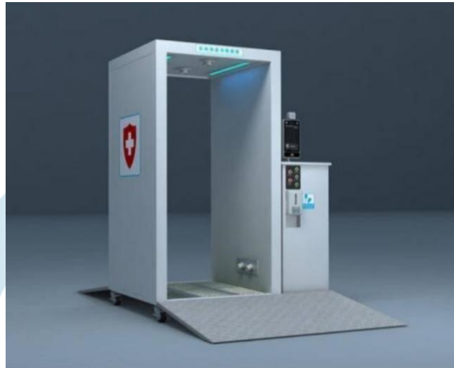
Graphical representation of the model

In this paper, detail survey of various approaches for Health Monitoring System is done. The paper also concludes with future conclusion. Our system relies on both open hardware and free software, being definite and desirable advantage for such systems. In future it is planned to experiment with various deep learning and computer vision framework for objects detection on raspberry pi in order to achieve higher framerate. Finally the ultimate goal is to integrate the framework for efficient resource planning during pandemic crisis in order to enable efficient security personnel scheduling and mask allocation, together with risk assessment based on statistics about respecting the safety guidelines