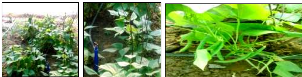
Fig 3: A view of study of Bean crop treatments