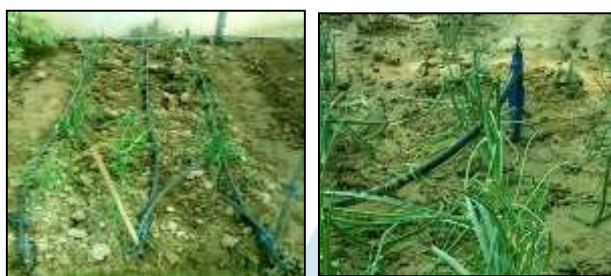
Fig 4: A view of study site of Onion crop treatments