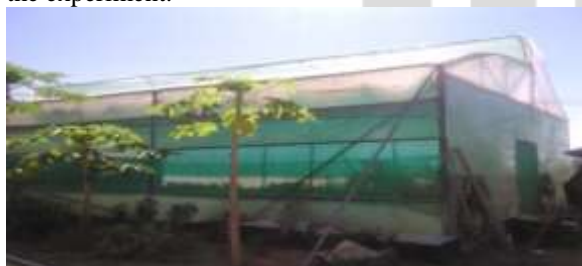
Figure 2: A view of high-tech poly house selected for study site

High-tech poly houses are basically naturally ventilated climate controlled and have a variety of applications, the majority being, growing of vegetables, floriculture and planting material acclimatization, fruit crop growing for export market. The high-tech poly house generally reflects back about 43% of the net solar radiation incident upon it allowing the transmittance of the “photo synthetically active solar radiation” in the range of 400-700 nm (Nanometer) wave length. The sunlight admitted to the protected environment is absorbed by the crops, floor, and other objects. So, a high-tech poly house situated in the aforementioned study site was selected for the present study (Figure 3.2). In the existing high-tech poly house, two types of irrigation systems such as drip and micro-sprinkler irrigation systems are available. It is a high cost structure of about Rs.2,23,000 and has been selected to carry out the experiment.