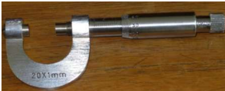
Photo – 1 - Micrometer